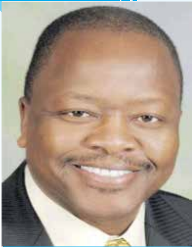
SEN. MUTAHI KAGWE, EGH (CS)

T o accelerate achievement of the Third Medium Plan under the Kenya Vision 2030, His Excellency President Uhuru Kenyatta led the government to conceptualize the Big Four Agenda, a development priority list that covers food security, manufacturing, affordable housing and affordable healthcare for all. To achieve affordable healthcare, the Universal Health Coverage (UHC) goal was adopted in order to expand access to quality healthcare minus financial barriers. This would be achieved through stronger collaboration between government, development partners, private sector and communities.